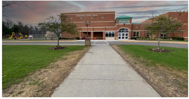
Germantown Central School District

At Ichabod Crane High School, peer mediators practiced and enriched their mediation skills. Cairo-Durham and Germantown elementary school students and Catskill middle schoolers met regularly to practice communication and problem-solving skills. Anti-bullying and cultural and racial diversity and inclusivity awareness programs were infused in all the programs. None of these programs were "one-offs," but were on-going programs, each one building upon the next.