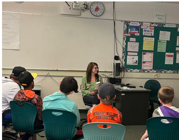
Germantown Middle School

The Dyson Foundation Berkshire-Taconic Community Foundation Stewart's Shops The Bank of Greene County IOLA in partnership with the New York State Dispute Resolution Association