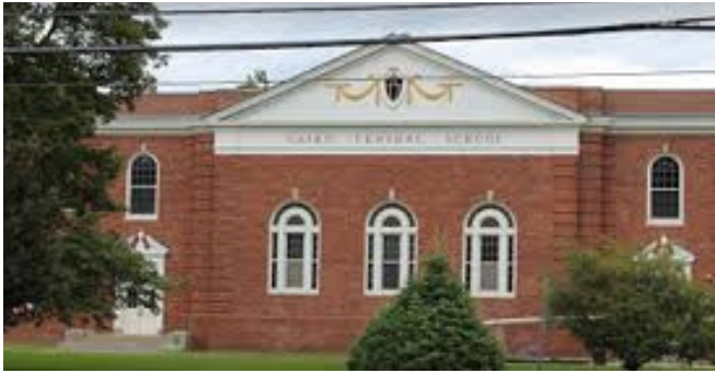
Cairo-Durham Middle School